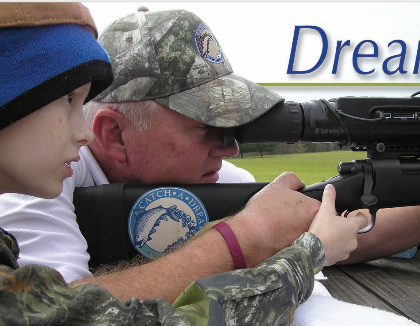
Story By Mark Beason

You don't have to have a rabbit's foot in your pocket, pick a four-leafed clover or toss a penny in a well to have your dream come true.